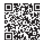
Apple App Store