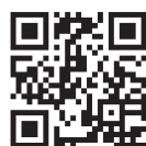
School of Computer Science