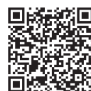
Google Play Store